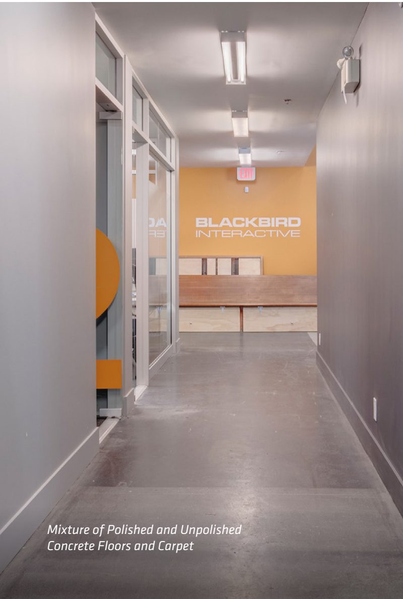
Mixture of Polished and Unpolished Concrete Floors and Carpet