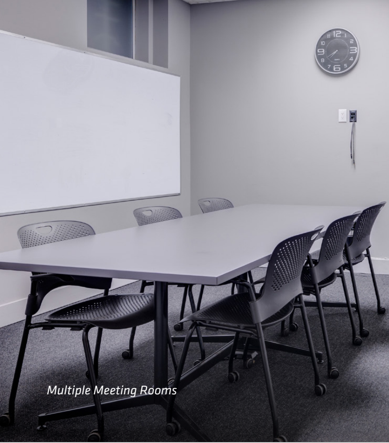
Multiple Meeting Rooms